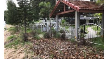
Prajuab with new boundary,