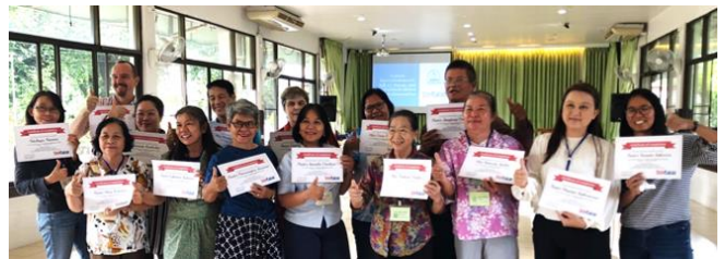
Step ahead seminar group

September started with the “Step Ahead” seminar. This is a seminar helping church leaders and members to understand the needs of poorer communities and giving guidelines to help them in order that families will be able to stand on their own and thrive all the time presenting the message of the gospel and the Saviour who can “help in time of need”.